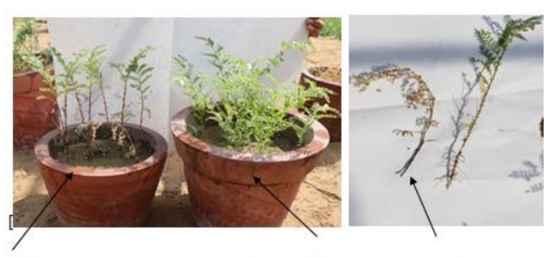
Infected plant Healthy plant Infected roots Plate 1: Pathogenicity test of Macrophomina phaseolina with chickpea plant