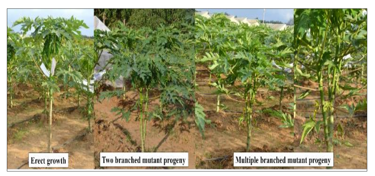
Plate 9: Variations in growth habit observed among mutant populations

Branching is phenomenon which occurs upon induction of stress. In this experiment induction of mutation might have acted like stress inducer in papaya var. Arka Prabhath resulting in branched plants. Again, extent of branching was observed among mutant populations which ranged from 2-5 branches per plant. This result was in accordance with research findings of Froneman (1999)<sup>[5]</sup>, observed higher frequency of branches by gamma irradiation (30-75 Gy).