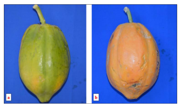
Plate 7: Shelf life studies; a) Fruit at harvest taken for shelf life studies b) Fruit at fully ripen firm stage recorded for shelf life studies