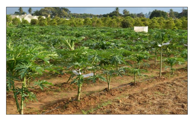
Plate 3: Field view of mutant progenies