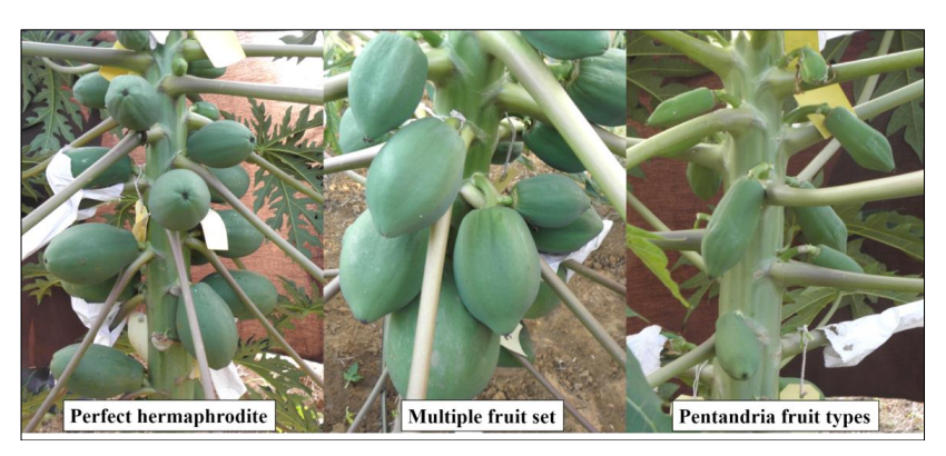
Plate 5: Variation observed among mutant populations for fruit characters

per tree, yield per tree and PRSV incidence. Results pertaining to all fruit, quality parameters and PRSV incidence among the M_1 progenies of Arka Prabhath are presented (Table 4) here under. Variation with respect to fruit characteristics were observed among mutant populations (Plate 5)