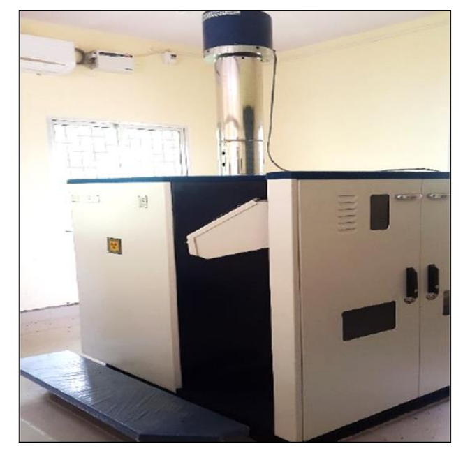
Plate 1: View of gamma chamber used for induction of mutation in papaya

Table 1: Specifications of Gamma Chamber 5000