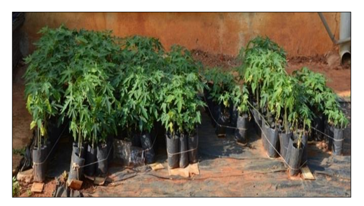
Plate 2: Hardened mutant seedlings

Seeds of Carica papaya var. Arka Prabhath were used for induction of mutation. Both physical (gamma ray) and chemical mutagens (EMS) were used for mutagenesis. For gamma-irradiation, dry seeds were exposed to different doses in gamma chamber at IIHR. For chemical mutagenesis, seeds were soaked in sterile water overnight and treated with different concentrations of Ethyl Methane Sulfonate (EMS). After germination, seedlings were hardened (Plate 2) and field planted for evaluation (Plate 3).