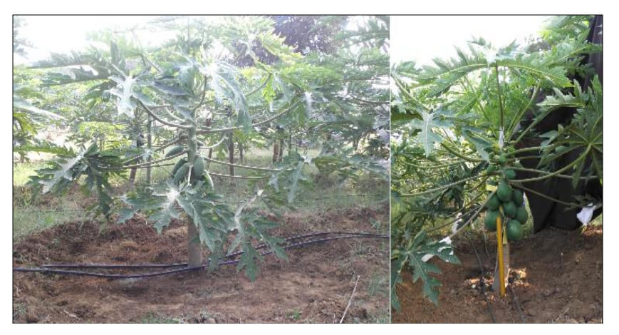
Plate 4: Field view of Ultra-dwarf mutant observed in mutant population

The data on days to first flowering revealed significant difference among the treatments and ranged from 68.66 to 87.33 cm (Table 3). Among the seeds germinated, the treatment T_{10} ; EMS @ 0.50 % has recorded significantly lowest (68.66 cm) plant height. The next lowest height (75.33 cm) was recorded in the treatment T_9 : EMS0.25 % followed by T_8 : Control (wet seeds) (77.00). The highest plant height (87.33 cm) was recorded in the treatment T_3 : 100 Gy which was on par with control ( T_1 : dry seeds @ 85.00 cm) (Plate 4).