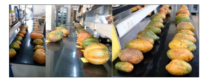
Plate 8: Shelf life studies in mutant progenies