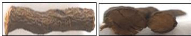
Fig 1: Morphology of Plumbago zeylanica root.

Root is dark brown in color. The root surface is rough and firm due to scaling off of longitudinal striation. Inner side of root is creamy white, soft and collapsed and non-collapsed phloem zone distinctly visible (Fig. 1).