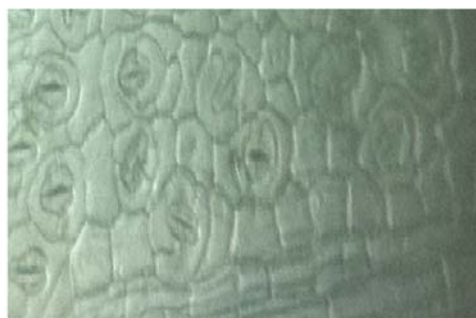
Fig-3: Diacytic Stomata

Quantitative leaf microscopy is used to determine the stomatal number, stomatal index. Fragment of lamina showing stomata and venation. Stomatal index was found for upper and lower epidermis is 33%. Stomatal number for upper epidermis is 15 and lower epidermis is 18 (Figure: 3).