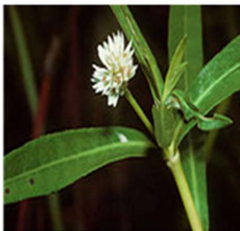
Fig 1: Alternanthera philoxeroides