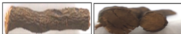
Fig 1: Morphology of Plumbago zeylanica root.

Root is dark brown in color. The root surface is rough and firm due to scaling off of longitudinal striation. Inner side of root is creamy white, soft and collapsed and non-collapsed phloem zone distinctly visible (Fig. 1).