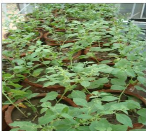
Flowering stage of Ashwagandha