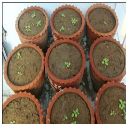
Ashwagandha germination in earthen pots

II) heavy metals treated plants and also was increased in No. of leaves compared to control plants (Treatment No. I) and heavy metals + Calcium hydroxide treated plants (Treatment No III). The No. of fruits per plants, leaf area reduced in the (Treatment No III) heavy metal+ Calcium hydroxide treated plant compared to control plants (Treatment No I) and heavy metals treated plants (Treatment No II). Productivity was reduced in the plants grown in heavy metal treated plants compared to control plants. This indicates that the heavy metal effects on the growth and development of the plants and ultimately the yields.