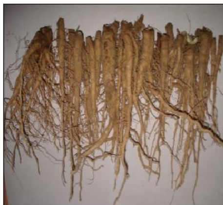
Roots of Ashwagandha