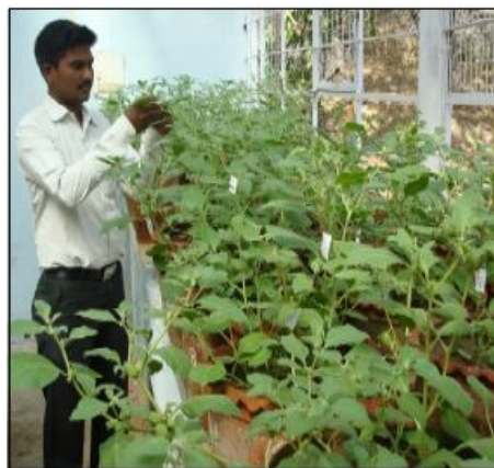
Measuring the plant parts