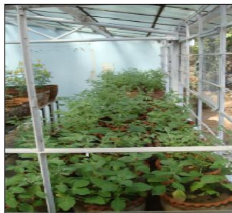
Ashwagandha mature plants