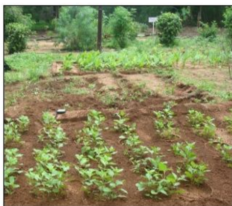
Ashwagandha cultivation in field