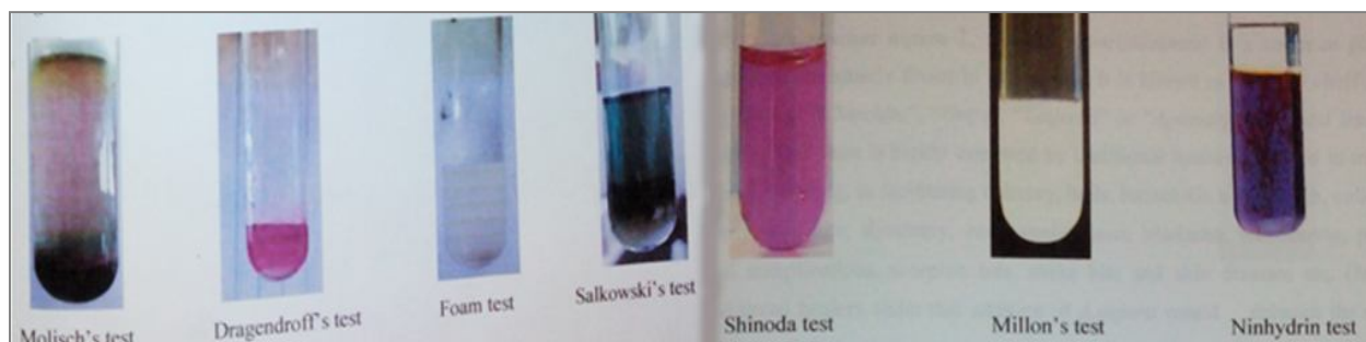
Fig 3: Chemical tests of Acetone solvent Extract: