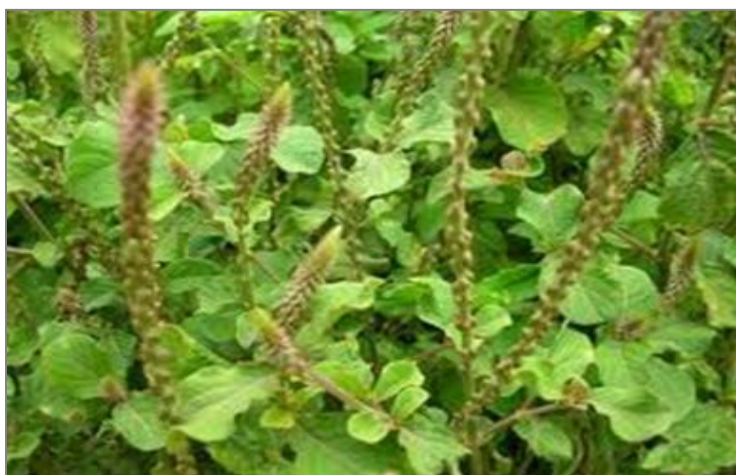
Fig 1: Achyranthes aspera Linn Plant: