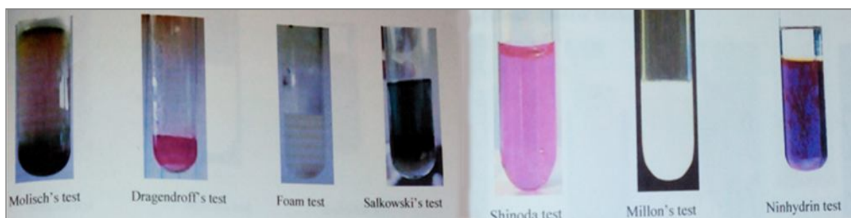
Fig 2: Chemical tests of Benzene solvent extract: