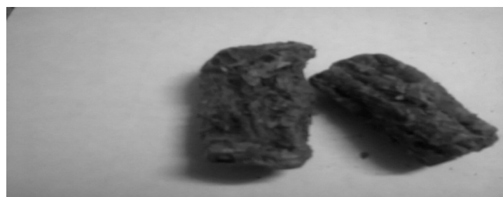
Fig 1: Dried rhizome of Bergenia ciliata

T.S of rhizome shows cork divided into two zones, outer zone which is denser made up of compressed cells and inner multilayered zone composed of thin wall, tangentially elongated cells. Cortical zone is parenchymatous having few rosette crystals, large number of starch grains and tanniferous cells. Vascular bundle are arranged in a ring and are conjoint, ollateral and open. Xylem consists of vessel elements, tracheids, xy lem parenchyma and xylem fibers.