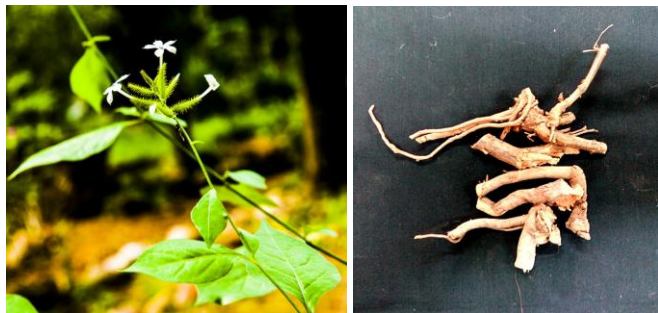
Fig 2: Plumbago zeylanica – Habit & Dried roots

Root length up to 0.3-0.5 meter, wiry, light yellow colour when fresh and reddish to pale brown when dry. Dried roots are uniform, cylindrical in shape, smooth surface and woody hard with characteristic very light pungent odour.