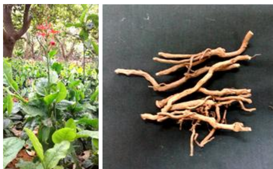
Fig 1: Plumbago indica – Habit & Dried roots

Root up to 0.6-0.75 meter length, tuberous, light brown colour when fresh and dark brown to blackish brown when dry. Dried roots are irregular and angular in shape, wrinkled and very brittle with characteristic strong pungent odour.