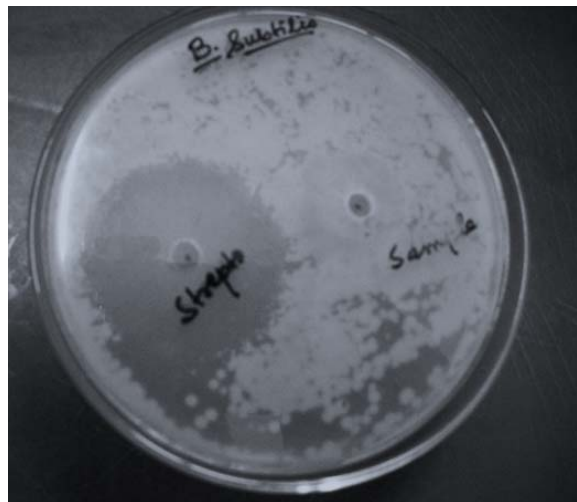
Fig 3: Zone of inhibition by T. dioica root extract against B. subtilis with regard to streptomycin control