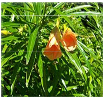
Fig 1: Thevetia peruviana

In Ayurveda Emblica officinalis fruits are reputed Rasayanas and rejuvenators. They are extensively used in Ayurvedic preparation for the treatment of a number of diseases and debility stats and are one of the three constituents of triphala (equal parts of three myrobalans, taken without seed).