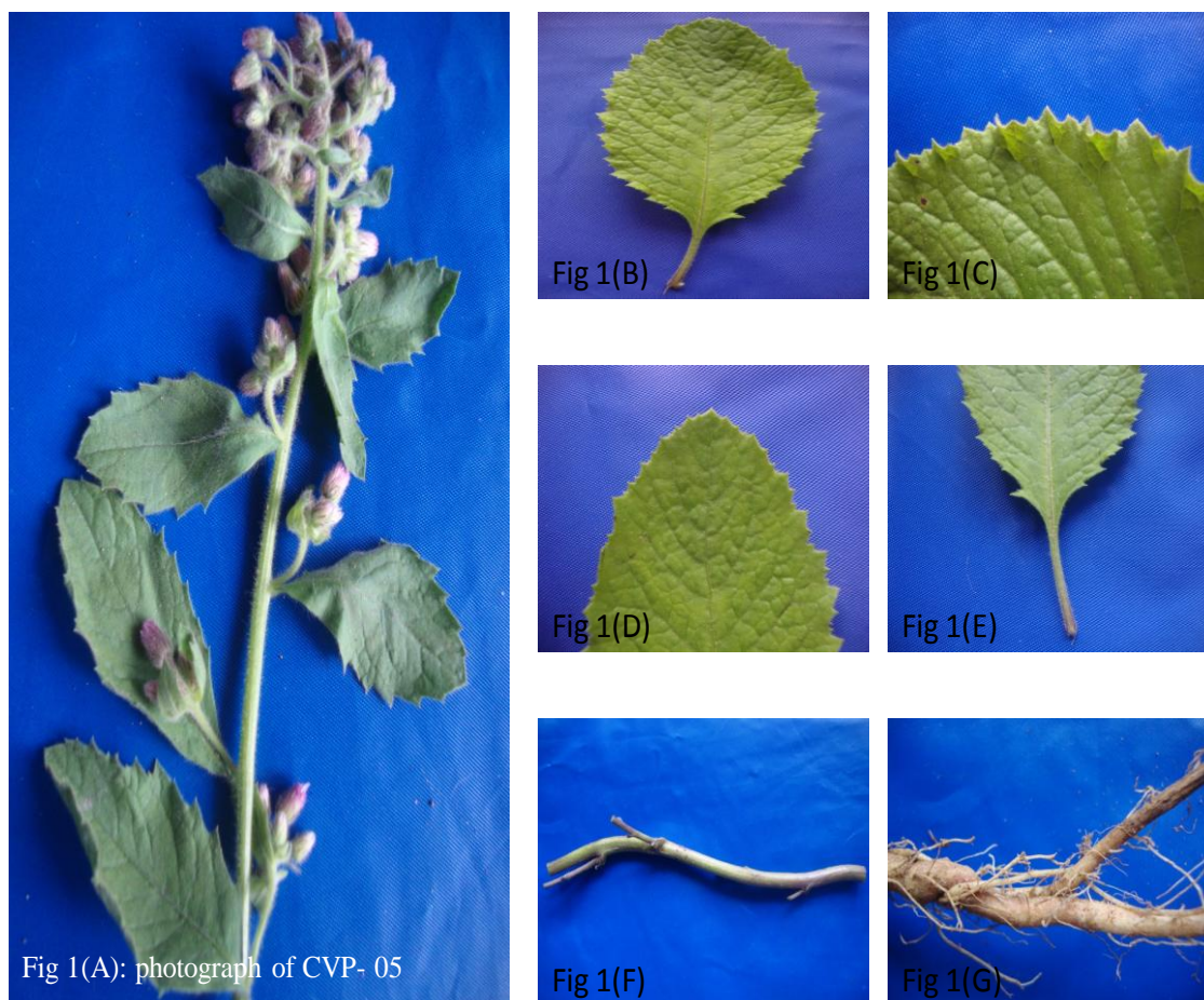
Fig 1: Roots, stem leaves and inflorescence of Blumea mollis (D. Don) Merr.