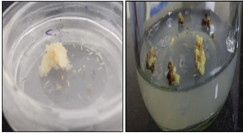
Anther culture response in Moroberekan and Jaya