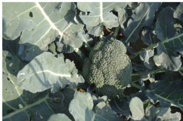
Fig 2: Matured broccoli crop

on yields of broccoli presented on Table 1 and Figure 2 & 3. Response of broccoli yield over control due to each treatment were 2.22 t/ha (100%), 1.92 t/ha (86.48%), 1.11 t/ha (50.00%) and 0.74 t/ha (33.33 %) respectively in jute agro textiles 800, 600, 400 and 200 GSM. The significantly highest yield ( P < 0.05 ) of broccoli crop was observed in treatment T 1 - 800 GSM. But from percentage point of view, the yield increment was more in T 2 - 600 GSM from T 3 -400 GSM (36.48%) than T 1 -800 GSM from T 2 -600 GSM (13.52%). Similarly fruit weight and size were also highest in case of T 1 i.e. 1.2 kg (weight) which is double of the control and the response of others were 400g (66.6%), 300g (50%) and 200g (33.3%) respectively in T 2 , T 3 , T 4 treatments over control. The above findings was supported by Paza (2007) [12].