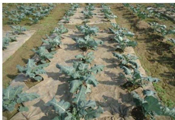
Fig 1: One month aged broccoli crop with JAT