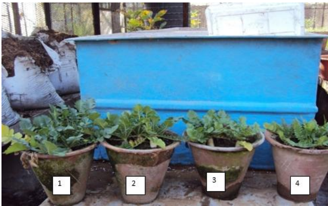
Plate 1: The growth of Raphanus sativus (Radish) plants in different fertilizers viz. vermicompost (1), cow dung (2), urea (3), and control (4)

Value denoted by similar letter in each column do not differ significantly.