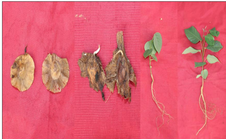
Plate 1: Developmental stages of seed germination in P. marsupium

embryo to germinate which is also reported by Ahire et al. (2009) in case of Uraria picta [2] . Usually the seeds of fabaceae with hard seed coat show enhanced germination when various pre-sowing treatments are used, it was also reported by Palaniet al. (1996) in Albizia lebbbeck [13] , Anand et al. (2012) in Melia dubia [4] .