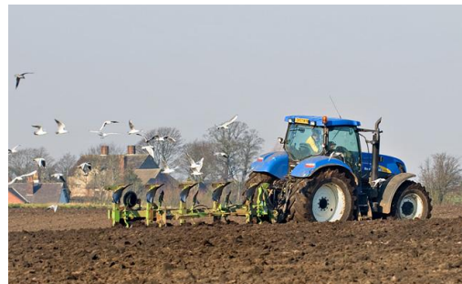
Modern way of Ploughing depicting advancement of Mechanical Engineering

Further advancement took place and tractor had replaced the cattle used for ploughing. A detail picture of modern way of ploughing is depicted below: