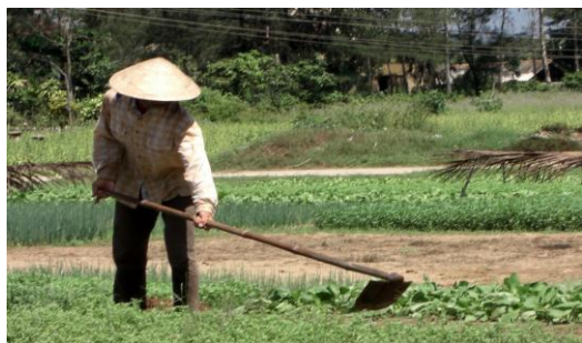
Peasant in Vegetable Garden using Hoe for ploughing

Agriculture is the basic of food industries and is defined as the process of producing food, feeding products, fiber and other desired products by the cultivation of certain plants and the raising of domesticated animals (livestock). The practice of agriculture is also known as "farming". Scientists, inventors, and others devoted to improving farming methods and implements are also said to be engaged in agriculture. One of the most relevant things in agriculture is Ploughing. Ever since the plough started, it had simply started by human hand barely. The next level of ploughing was Hoeing, which reflects its root to Mechanical Engineering. In this era, the soil was turned using simple hand-held digging sticks and hoes. It can be roughly termed as the 1 st stage of Mechanical Engineering in Agriculture of Food Industry. Below picture depicts the Hoeing method.