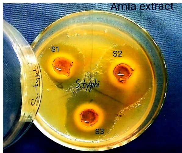
Plate 2: Antimicrobial test of amla extract against S. typhi

Emblica officinalis (Amla) plant extract (leaves) showed the highest antimicrobial activity against S. typhi (Gram -ve) with mean ZOI being 23.77mm. The lowest antimicrobial activity of amla in ethanol extract was observed against S. aureus (Gram +ve) with mean ZOI being 12.99mm. The reason may be the presence of chebullic acid, gallic acid, saponins, etc. whose nature enhance in presence of ethanol. Hence, ethanol extract showed antimicrobial activity even against Gram -ve MDR bacteria. Nascimento et al. (2000) [7] conducted study which supports the finding of present study in which guava extract showed inhibitory effects against S. aureus and B. cereus but no effect on E. coli and S. typhi .