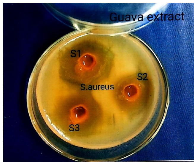
Plate 1: Antimicrobial test of guava extract against S. aureus

Psidium guajava (guava) plant extract (leaves) showed the highest antimicrobial activity in methanol against B.cereus (Gram +ve), the mean zone of inhibition (ZOI) being 18.77mm. The lowest antimicrobial activity of guava in methanol extract was observed against E. coli with mean ZOI being 4.11mm. Clear zone of inhibition for E. coli was not obtained in 24 hours but took 48 hours to show inhibition. The inhibitory activity should decrease with time but in this it showed significant increase. In few samples of methanol extract of guava no inhibition was obtained against E. coli . The resistance of Gram -ve bacteria could be due to its cell wall structure which is biochemically more complex than Gram +ve and appears usually trilayered, besides peptidoglycan, there are phospholipids, proteins, and lipopolysaccharides in the cell wall.