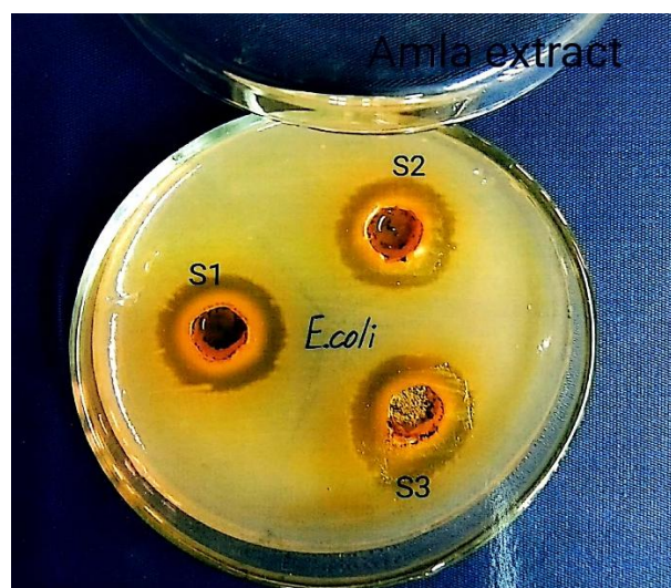
Plate 3: Antimicrobial test of amla extract against E. coli