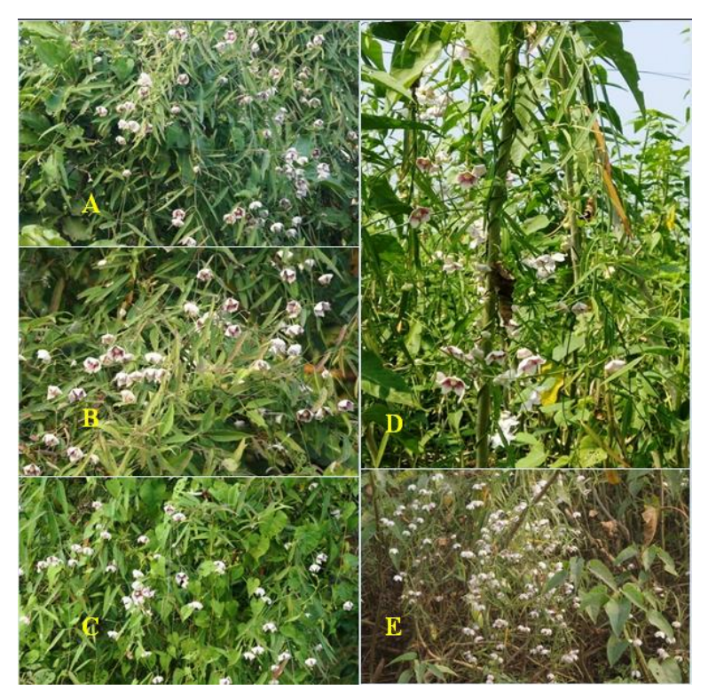
Plate 2: Recorded few host plant species of O. esculentum on which it climb Note: (A) Ficus hispida Linn.f.; (B) Vitex negundo Linn.; (C) Ipomoea spp. & Vitex negundo Linn.; (D-E) Ipomoea carnea Jacq

sepals; petals (I-J) purpled united petals from inside and having pollinia; (K) Was visitation to flower; (L) follicular fruit; (M) un-ripened fruit with haires; (N) ripened fruit with white hairs for seed dispersal