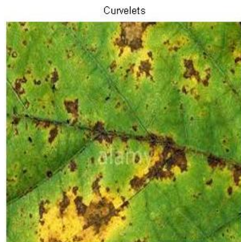
Fig 2: Curvelet transformed image

rise to edges; and these edges are typically curved for crop or weed. As Curvelet are good at approximation curved singularities, they are fit for extracting crucial edge-based features from images more efficiently than that compared to wavelet transform. The Curvelet decomposed images are called 'Curvelet images'. The approximate Curvelet images contain the low-frequency components and the rest captures the high-frequency details along different orientations. After applying inverse wrapping based Curvelet transformation, Figure 2 show the Curvelet transformed image.