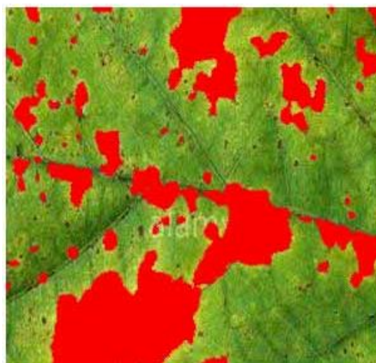
Fig 3: Disease Detection output

Where NTP is the true positive measurement, NTN is the true negative measurement, NFP is the false positive measurement (a portion of the image incorrectly classified, and NFN is the false negative measurement (a portion of the image incorrectly classified as not a disease). The proposed approach achieves better performance in terms of the disease accuracy. The accuracy of the proposed approach is 95.45%. The proposed method show improving leaf disease classification quality against various lighting conditions and complex background. The Figure 6 shows the output image of the proposed disease detection from the plant leaf image extraction method.