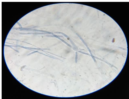
Fig 2: Microscopic view of S. rolfisii