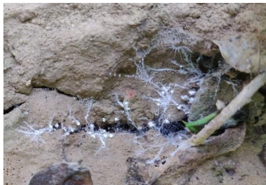
Fig 1: Mycelial growth on plant