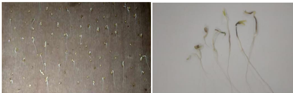
At 400 ppm of CuNP observed burning symptoms in seedling.

Fig 5: Image showing negative effect of Cu NPs on seed germination and seedling growth of Capsicum annuum at higher concentration.