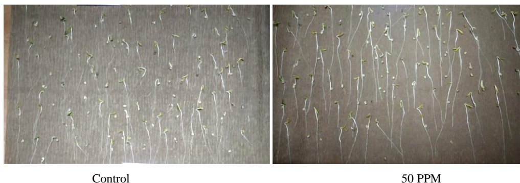
Fig 4: Image showing effect of Cu NPs on seed germination and seedling growth of Capsicum annuum