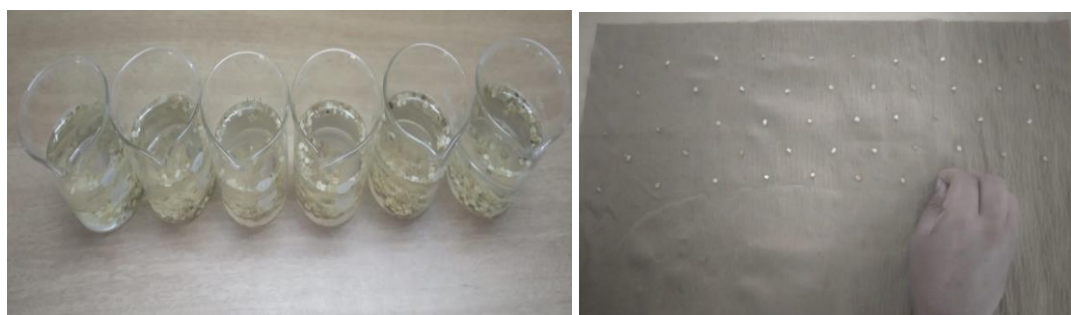
Fig 1: Overnight soaking of chilli seeds with different concentration of nanoparticles.

Arka lohit hybrid seeds were soaked in prepared solution of silver and copper nanoparticles for overnight at room temperature (Fig. 1) and seeds shaken without the nanoparticles served as control. Treatment details are listed in Table1. This treated seed is taken for germination test, seeds were placed in a germination room having 27 ± 2 °C and 95 ± 3 per cent RH. The germination was recorded daily and other observations was taken once in 7 days and the final observations on 14 days as per ISTA (2010) [6] . At final count, shoot height and root length were measured. The effect of different concentrations of CuNPs and AgNPs viz. 10, 25, 50, 75, 100, 200 and 400 ppm were evaluated on growth of C. annuum and compare with control (untreated). Various parameters of germination such as Germination percentage (GP), Shoot length, Root length, Seedling vigour index I and seedling dry weight were also studied.