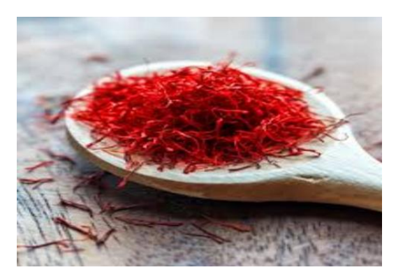
Fig 6: Saffron

Mainly consists of dried stigmas and upper parts of styles of plant known as Crocus sativa in Fig. (5), belonging to the family Iridaceae. It is rich in carotenoid glycosides, mainly containing terpenoids. It lightens the skin tone and