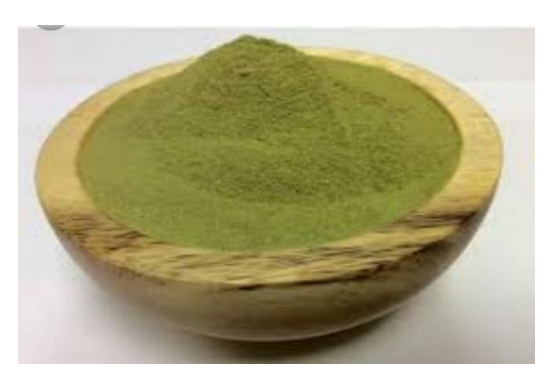
Fig 8: Neem powder

It has antifungal, antibacterial properties and rich in vitamin c which in boon people with sensitive and oily skin.it also helps in treating other skin issue like blackheads, pigmentation, dullness and ageing, acne, skin problems.