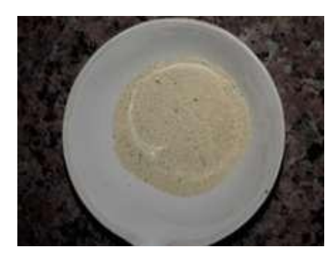
Fig 10: Prepared papaya face pack.

The powdered constituents were sieved using #40 mesh and mixed homogenously in Fig. (9) for uniform formulation. It was then kept in a moisture-proof container in a cool place for the purpose of standardization of various parameters. (Table 1).