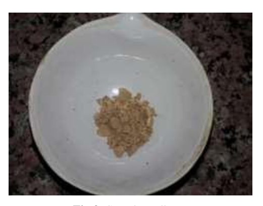
Fig 3: Santalum album.

White Sandalwood powder in Fig. (3) is used to cure various skin allergies. It has cooling and soothing action. It protects the skin from environmental pollution and keeps it glowing, fair and healthy. Sandalwood possesses antimicrobial properties, therefore it is used to cure various skin problems and also removes scars, acne etc.