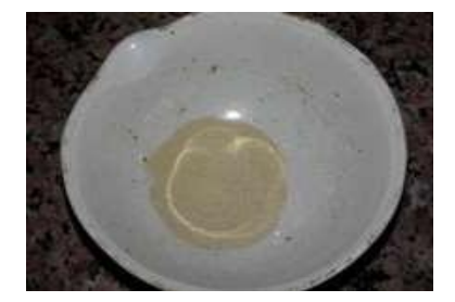
Fig 1: Multani mitti.

Fig. (1) Multani mitti which helps to remove the impurities in the form of dead skin cells. It helps to make the skin radiant. It has been proven best for the irritation-prone skin. Its soothing action calms the skin, cures the inflammation caused due to elevated phlogistic agents. It is perfect for oily skin. It removes the dirt and excess of oil by acting as a perfect adsorbent. It provides fresh, radiant and glowing skin.