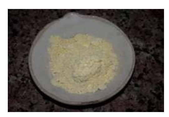
Fig 5: Gram flour.

Gram flour, commonly known as Besan in Fig. (5), has been used extensively since the olden times for its beauty-enhancing benefits. It mainly acts as a tonic for the skin as it helps to clean and exfoliate it. Gram flour is nothing but a pulse flour obtained from grinded chickpeas. It is very beneficial for skin as well as hair. It is used to decrease tanning of the skin, also reduces the oiliness of skin, thus proving as a good anti-pimple agent. It lightens the skin tone, therefore used as an instant fairness agent.