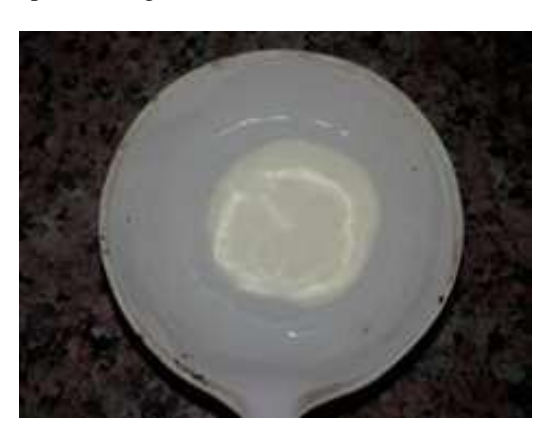
Fig 7: Milk powder

It is very beneficial for skin, as it provides nourishment for dry, rough skin for the longer duration. Milk cream either in the form of powdered raw milk in Fig. (6) or milk as such provides a brilliant shine to skin. This is beneficial in hydrating the face deeply and makes skin youthful, lustrous and flawless. It bleaches the skin to remove dark spots, pigmentation, acne etc . This pack also removes blackheads, whiteheads, and other skin imperfections naturally. This facial pack helps in fading sun tan.