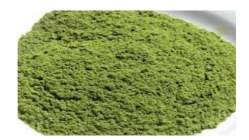
Fig 9: Papaya leaves powder

Papaya leaf juice applied along with fruit pulp helps to open the clogged pores of skin and clears pimples, acne and oil. this is the reason why there are papaya leaf and fruit extract in many face packs used facial and cleansing in market