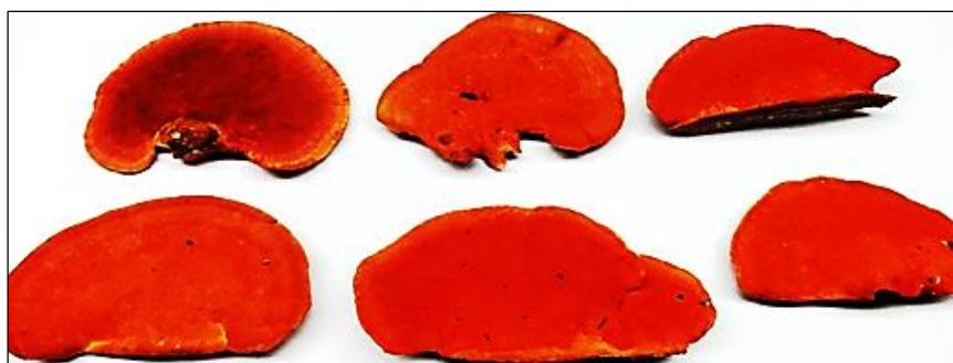
Fig 1: Ganoderma lucidum or Reishi or Lingzhi

Ganoderma lucidum (Fig 1 and Tab 1) is one of the most popular medicinal mushrooms for its unique characteristics throughout the world. It is known by different names such as Reishi, Lingzhi and Mannentake. This mushroom is popular mainly in China, Japan, Korea and other Asian countries. The dark, large mushroom have wood like texture and glossy exterior. In past studies, it was reported to alleviate numerous diseases by this mushroom spp. (Hawksworth 2001, Kingston and Newman 2005) [4, 6]. This mushroom is found mainly on a variety of dead deciduous plants.