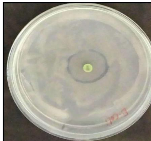
Fig 1: Zone of inhibition in E. coli

In the present investigation, the antibacterial activity of the leaf extract of Vitex negundo Linn assayed against three potentially pathogenic microorganism E. Coli , S. aureus and K. Pneumonia against same concentration of the extract to understand and the most effective activity.