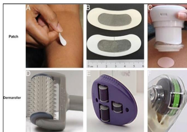
Fig 2: Application of microneedle in skin for cosmetic therapy

There are two different types of adipose tissues i.e. brown adipose tissue (BAT) and white adipose tissue (WAT). BAT plays a crucial role in producing heat thus increasing body