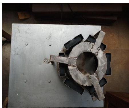
b) Top view of magnetizer