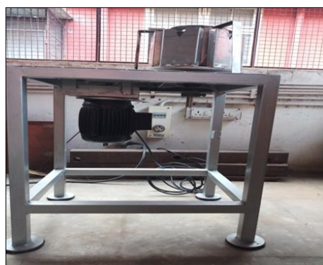
a) Full view of magnetizer

It is used to connect the running motor and based plate along with round plate. The length of shaft is 14.5 cm, of which 3 cm height of soft protruded just above the frame to hold the base plate and 7.5 cm length extended down through the frame to 0.5 hp motor.