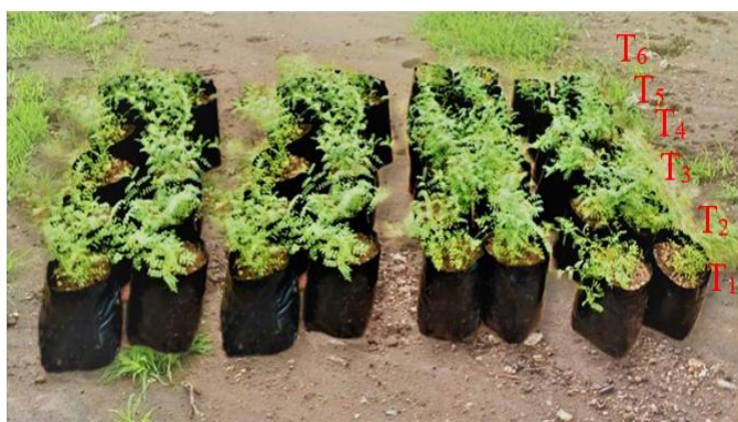
Plate II: Management of Fusarium oxysporum f. sp. ciceri with Pseudomonas fluorescens (Pot culture)

Post emergence seedling mortality was observed from 16.20 to 30.11 per cent in all treatments as against, 38.56 per cent in control. The least post emergence seedling mortality was found in PF5 (16.20%). This was followed treatments viz., PF2 (18.84%), PF4 (22.66%) and PF3 (25.27%). The seed treated with PF1 was found least effective with highest percentage of post emergence seedling mortality (30.11%).