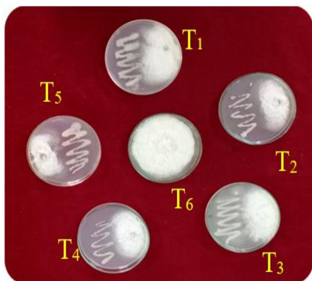
Plate I: Fusarium oxysporum f. sp. ciceri

Among five isolates tested (Table 1 and Fig.1), PF5 was found most effective in inhibition of mycelial growth (77.92%) with least mycelial growth (19.87 mm). The second best isolates PF2 recorded 28.25 mm mycelial growth with per cent inhibition of mycelial growth up to 68.61%. The PF4 and PF3 isolates recorded 64.58% and 55.27% inhibition of mycelial growth, respectively. The PF1 was found least effective in arresting the mycelial growth and recorded 40.42 per cent mycelial inhibition of test pathogen.