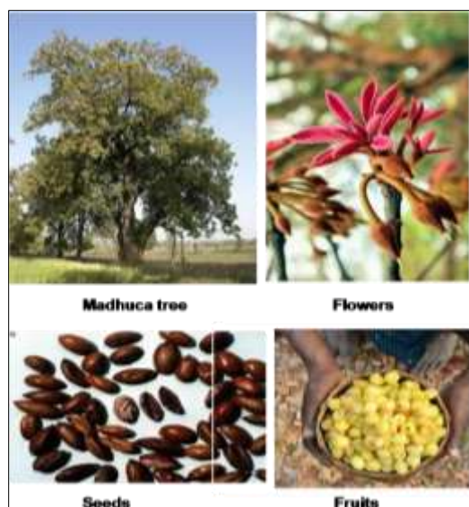
Fig. 1: Various parts of the plant ( www.google.com/images )

Mahua is a medium sized to large growing deciduous shady tree that grows about 16-20 meters tall. The plant is found mostly growing widely under dry tropical and sub-tropical climatic conditions. The plant grows well on rocky, gravely, saline and sodic soils, even in pockets of soil between crevices of barren rock. The plant has deep, strong taproot and short, stout trunk, 80 cm in diameter. The crown is rounded with multiple branches. The bark posses yellowish grey to dark brown color vertically cracked and wrinkled; exfoliating in thin scales and has milky substance inside. Leaves are thick, leathery having 10-30 cm length, lanceolate, narrowed at both ends, glabrous distinctly nerved and clustered at the end of the branches. It excludes a milky sap when broken. Young leaves are pinkish and wooly underneath (Fig. 1) [9-12].