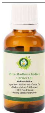
Fig 3: Madhuca indica carrier oil

Oil extracted from the seeds of the Mahua plant is applied over the area affected with skin diseases and body pain. Oil is available in the market under different brands (Fig. 3). Nasal administration of the fresh juice of the flowers of Mahua is used in diseases of vitiated pitta dosha like headache, burning sensation of the eyes etc. Dried flowers of Mahua is boiled in milk and administered in a dose of 40-50 ml to treat weakness of the nerves and diseases of the neuromuscular system. Decoction prepared from the bark of the tree is given in dose of 30-40 ml to treat Irritable bowel syndrome and diarrhea. Fresh juice of the flowers is given in a dose of 20-25 ml to treat hypertension, hiccups and dry cough [41] .