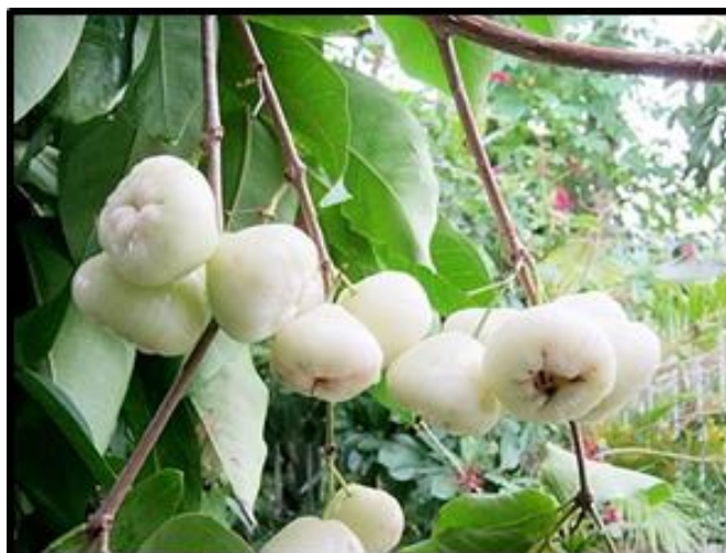
Fig 1: Fruits and leaves of rose apple.

Geographical distribution: Syzygium jambos is an indigenous plant to Malaysia and Indonesia, southern Asia and Andaman Island [3] .